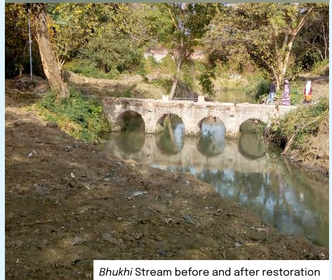
Bhukhi Stream before and after restoration