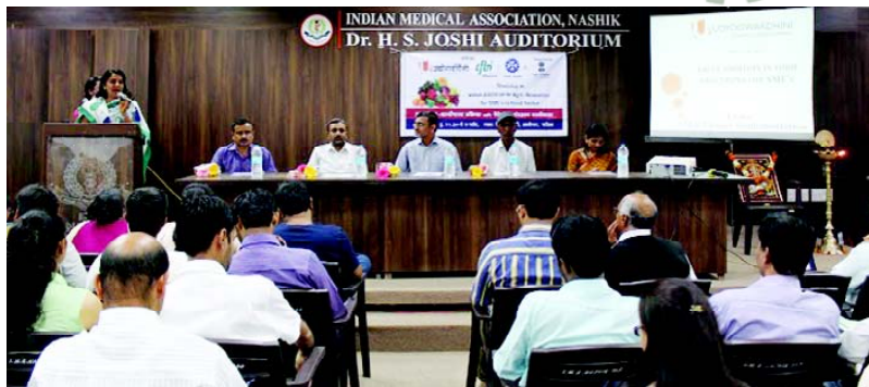
A view from the Inaugural Session of the SME Meet at Nasik (Maharashtra)

A total of 212 prospective entrepreneurs participated in the event. The participants expressed their interest to have similar workshops in the topics related to shelf-life extension of pomegranate, custard apple,