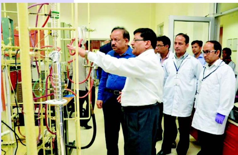
Dr Harsh Vardhan visiting the CSIR-Indian Institute of Petroleum (IIP) Campus in Dehradun