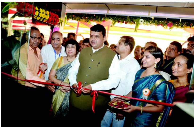
The Mumbai Complex of CSIR-National Institute of Oceanography (CSIR-NIO) was inaugurated by Chief Minister of Maharashtra, Mr. Devendra Fadnavis at the Regional Centre on Lokhandvala Road, on 26 March 2015