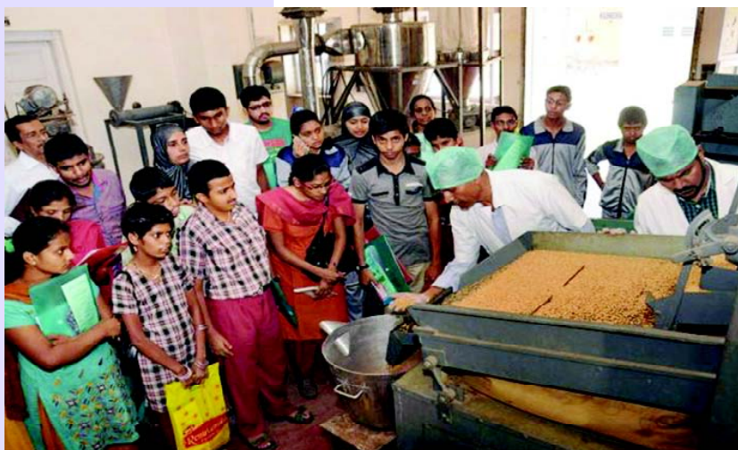
People with special needs watching a demonstration on how food technologies function as part of the CSIR-CFTRI workshop

In a unique initiative targeted at transforming people with special needs into successful entrepreneurs, the CSIR-Central Food Technological Research Institute (CFTRI), Mysore a premier food research laboratory of the Council of Scientific and Industrial Research (CSIR), organised a workshop on “Enabling the Specially-abled with CSIR-CFTRI technologies” on 29 April 2015.