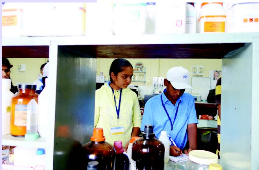
Summer School participants learning to work in the lab along with Scientist

The programme included provision of food and transport for the children. The students were encouraged to ask questions