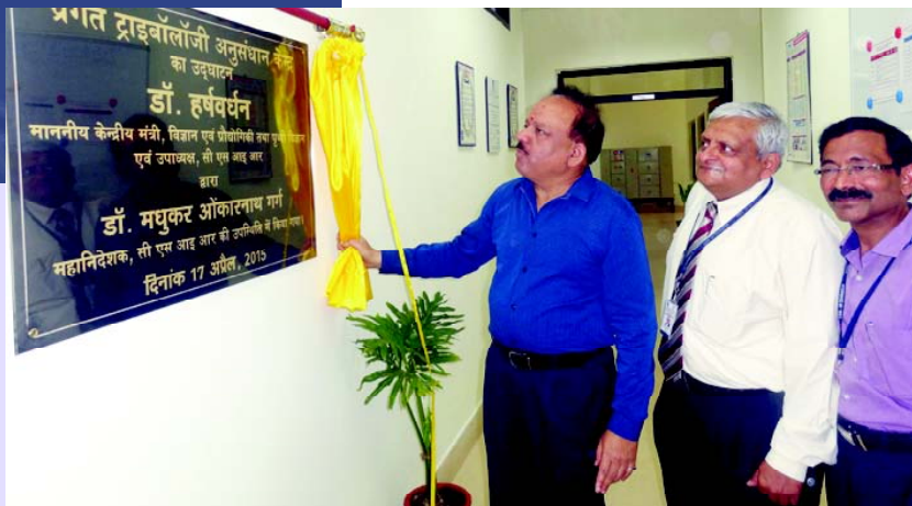
Dr. Harsh Vardhan unveiling the plaque to inaugurate the Advanced Tribology Research Centre, at the CSIR-Indian Institute of Petroleum, in Dehradun

While moving fast with alternative fuels, CSIR-IIP has continued with its founding mission of developing cleaner forms of fossil fuels. This has led to the development of a world class sweetening catalyst which helps to remove excessive foul smelling mercaptans from LPG. “After capturing the Indian market, recently 600 kg of this new material hit the international market,” Dr. Harsh Vardhan announced.