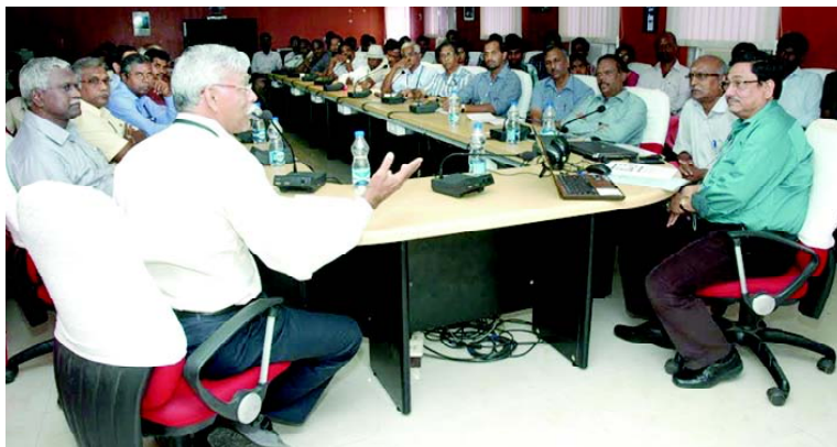
Director, CSIR-CECRI addressing the gathering