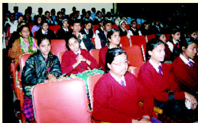
A view of the students participants of various school