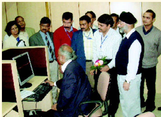
A view of the inauguration of In-silico lab

In-silico Laboratory inaugurated at CIMAP: Earlier